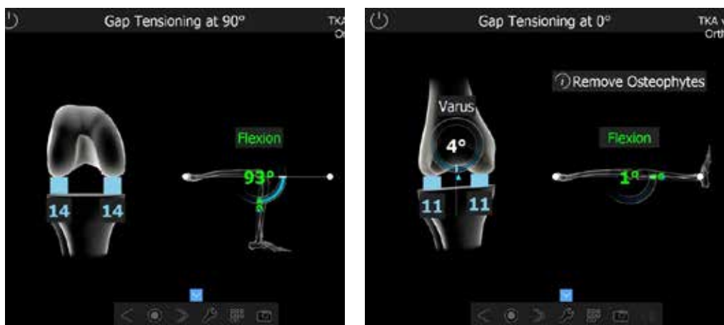
Fig. 4. Collateral ligament stress test (14 mm at 93° tibial flexion and 11 mm at 1° tibial flexion)