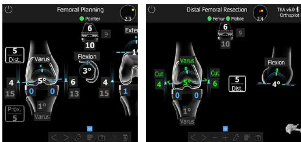
Fig. 5. Femoral planning stage, enabling selection of the most appropriate femoral component size and determination of the resection amount required for anatomically correct endoprosthesis implantation