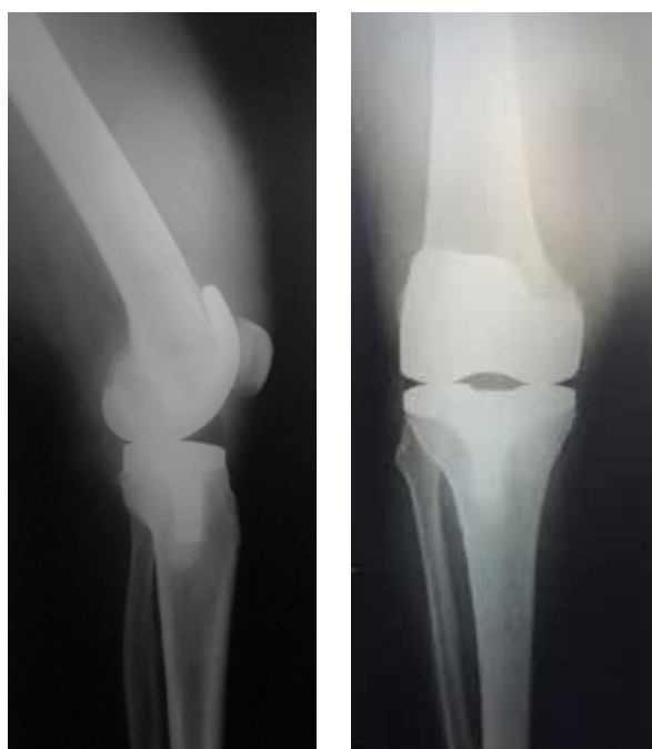
Fig. 6. Radiographs of Patient S., 55 years old, following primary total cemented right knee arthroplasty performed under computed navigation system control