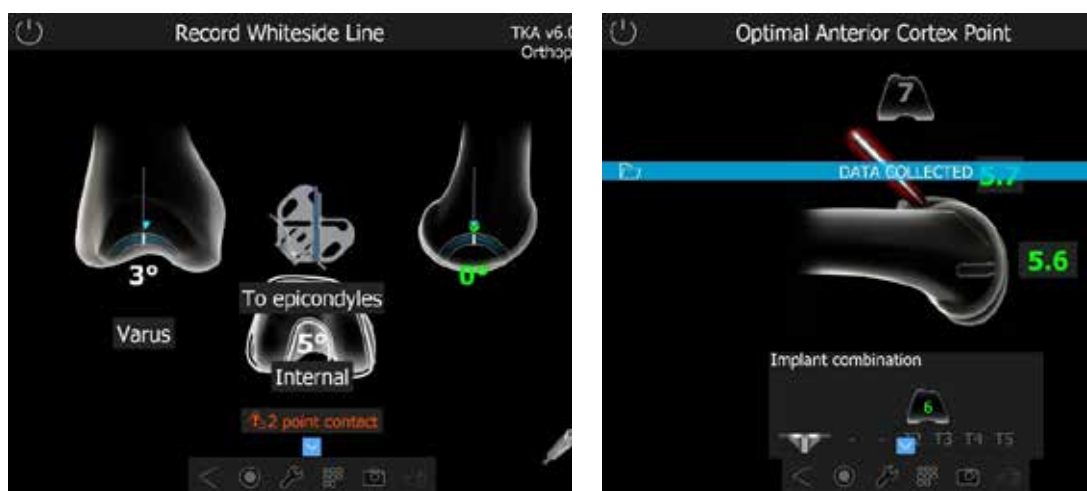
Fig. 3. Schematic image of points to determine the femoral component size